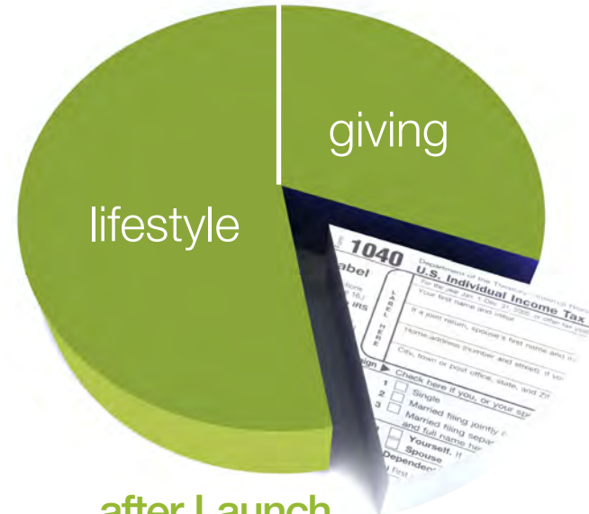
after Launch (asset-based giving)

So normally, if a giver wants to increase the amount they give, they only have one option: to cut into their lifestyle expenses (left). But now you can offer them a way to increase their giving by reducing their taxes (right). This is wiser stewardship, and it's possible by simply changing what they give, rather than how much they give.