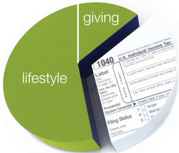
before Launch (cash-based giving)